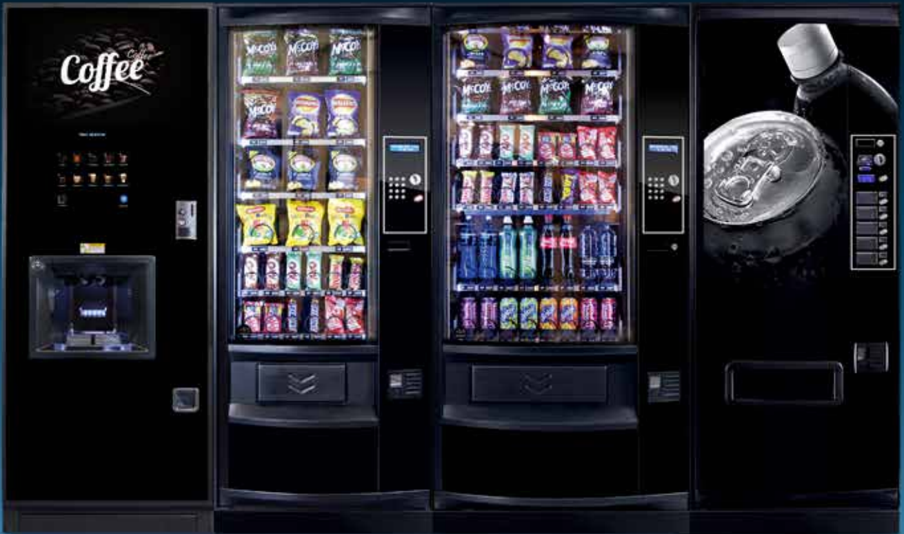
Shown in Neo ebony gloss finish